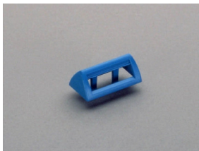
31086 label support for Triton, snap-on