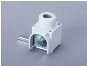
31028 connection terminal, side connection for 31014, 31024, 31309, 31311 6 - 50 mm 2