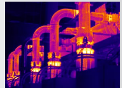
MultiSharp™ Focus produces an image focused throughout the field of view